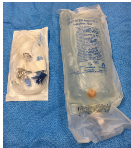
The fluids (right) for subcutaneous administration come in a plastic wrapper, as does the fluid line (left) that will be connected to the bag. This same bag and line can be used multiple times, until empty, but the needle must be changed after every use.

The system is now ready to deliver fluids. The process of assembling the setup that you just performed only has to be done once for each new bag of fluids, not with every treatment. Depending on the size of the bag and the dose of fluids you will give, one bag might last for several days.